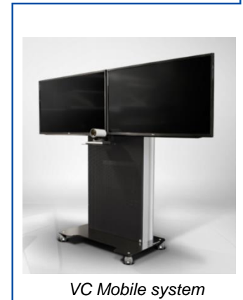
See page 3 for more details