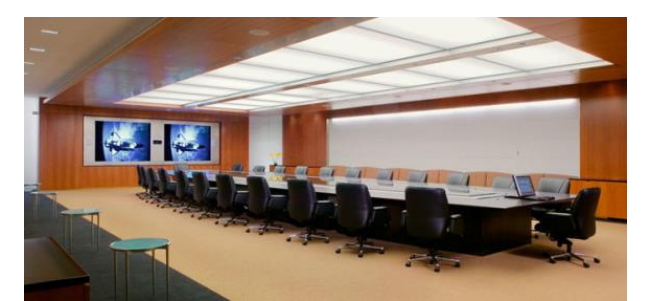
VC in Boardroom, large meeting room