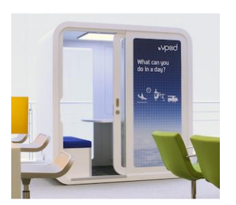
VC in Touchdown or Pod