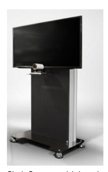
Single Screen, model shown by www.audipack.com model VCF-SL1