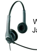
Wired headphone (3.5 Jack) for Landline, PC, smartphone, tablet