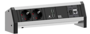
Desk power/data/USB management